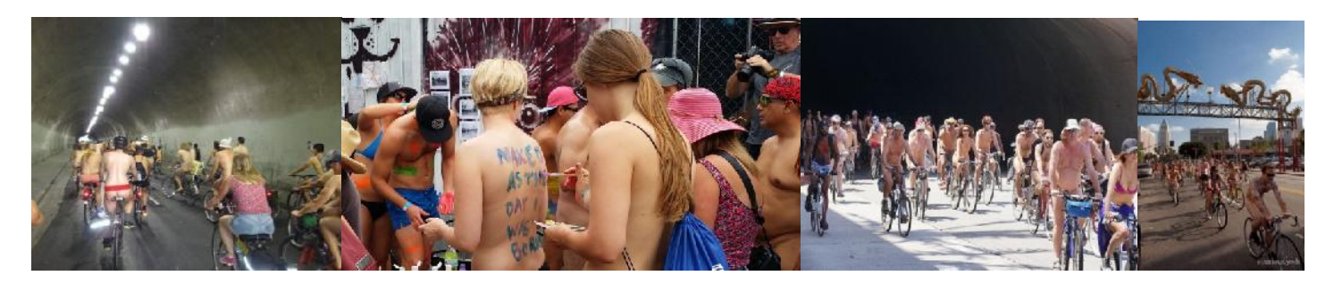
Yes! It's Legal! Photos from the 2015 WNBR-LA

How Many Are Coming? No way to know for this year, but we hope about 650 riders! Don't Be Left Out!